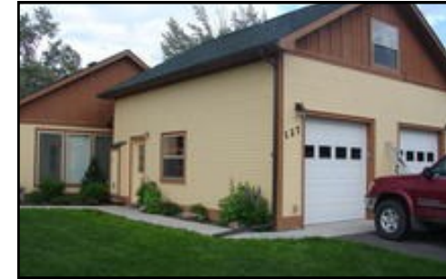
Bonus Room Above Garage

• How to determine the proper way to wire the "bonus" room above a garage . Is the garage attached to the house, and if so, is the room accessible from the house or only from the garage? If it is accessible from the house and is another level of the home, it will need a smoke detector. If it is only accessible from the garage it will not.